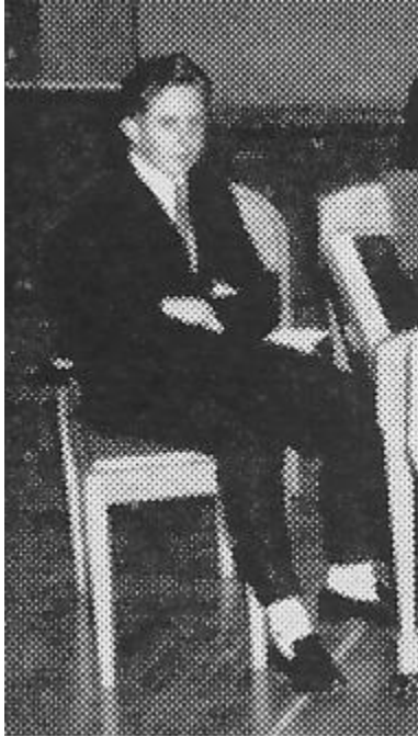
Pg. 158 Class Photo