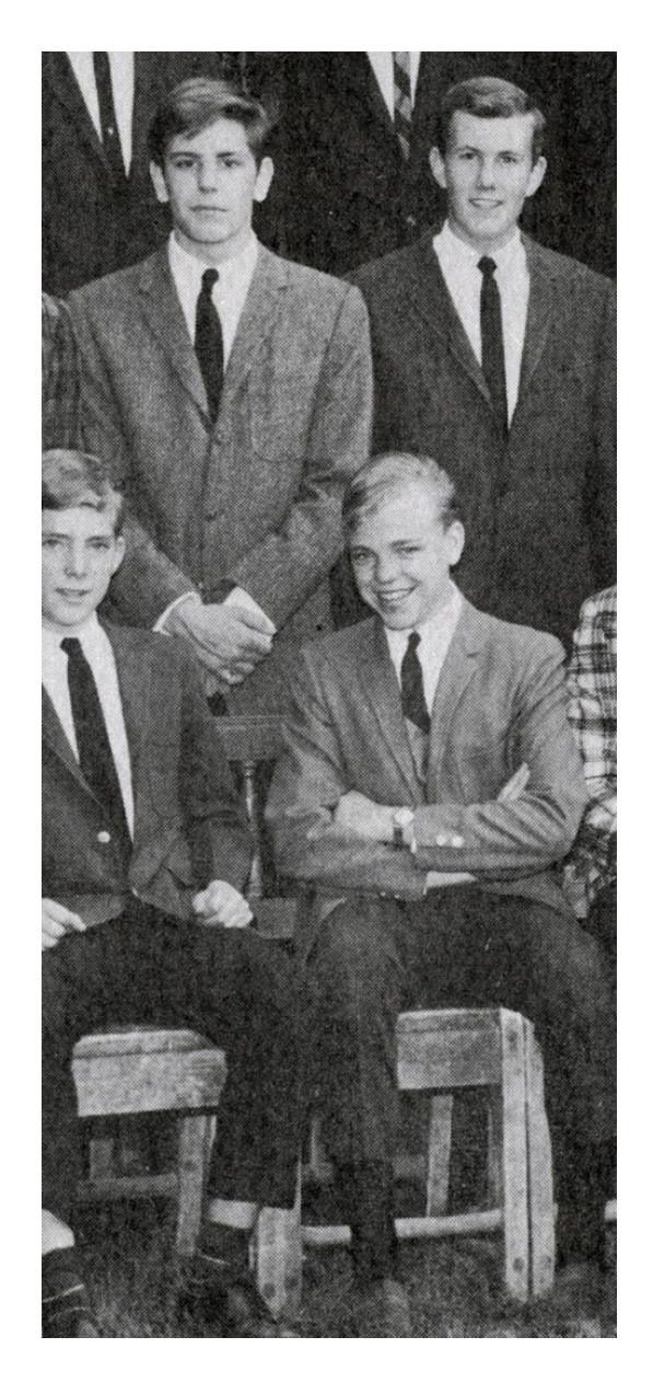
Debate Club group photo