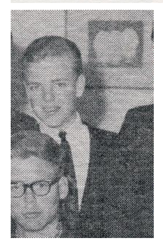
Ski Club group photo