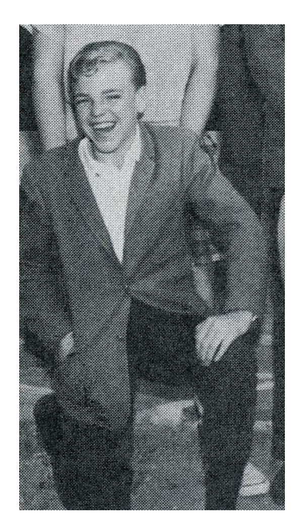
Ski Team group photo