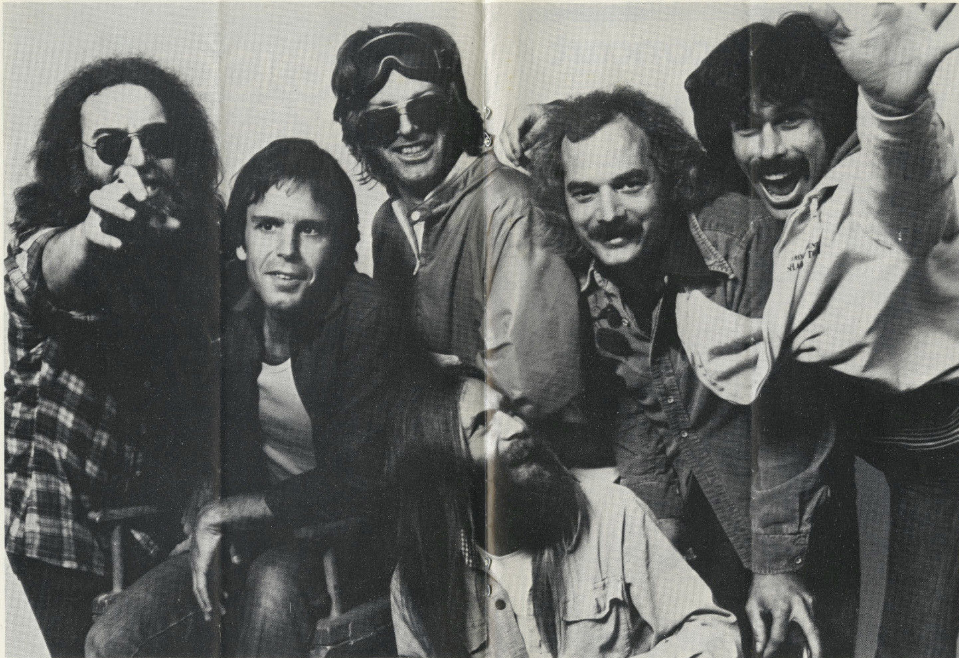
THE GRATEFUL DEAD