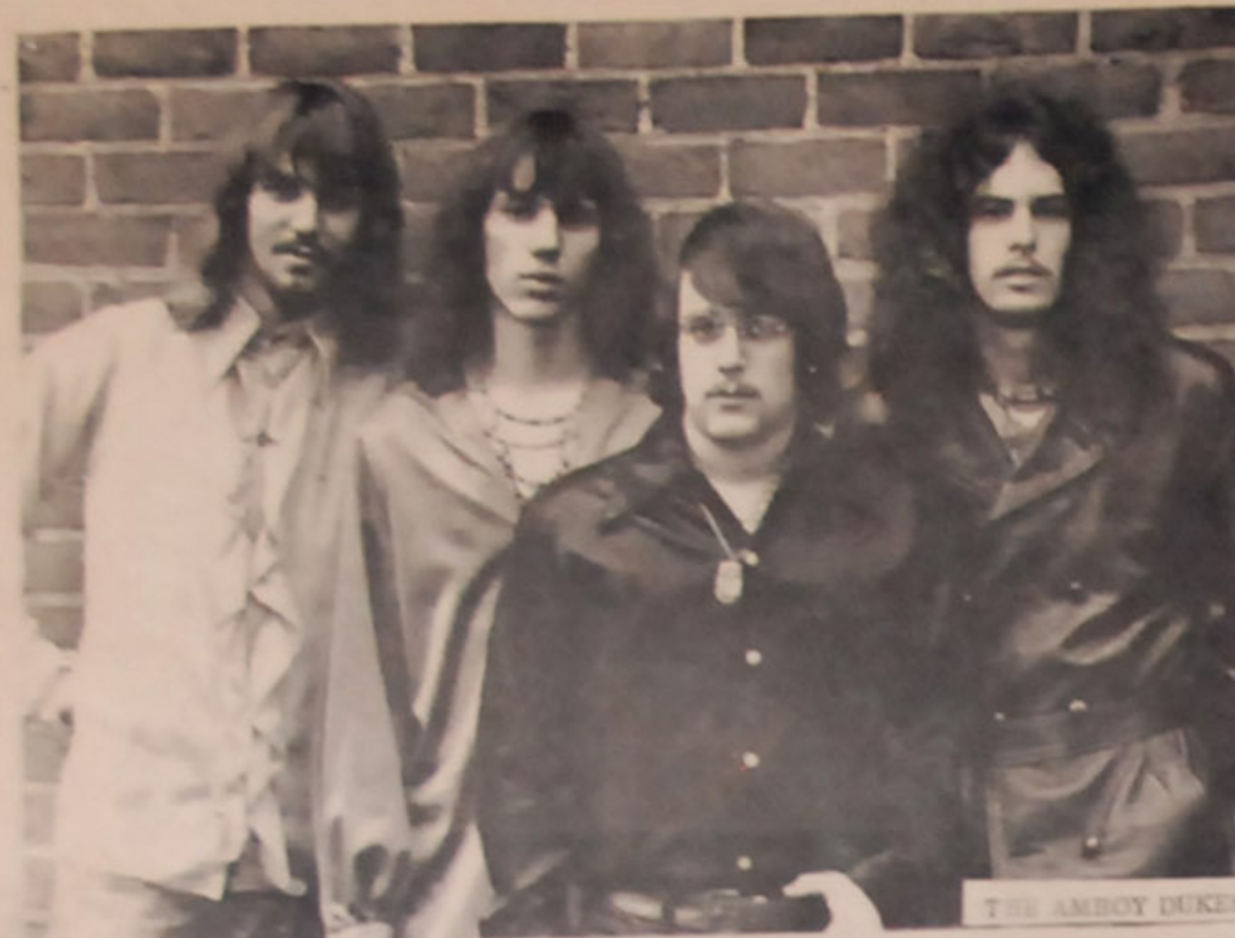
THE AMBOY DUKES

It was three years ago, somewhere in the wilderness outside Detroit when Ted first stuck his guitar behind his back and started playing. A week later, it was with his teeth, and another week, with his tongue.