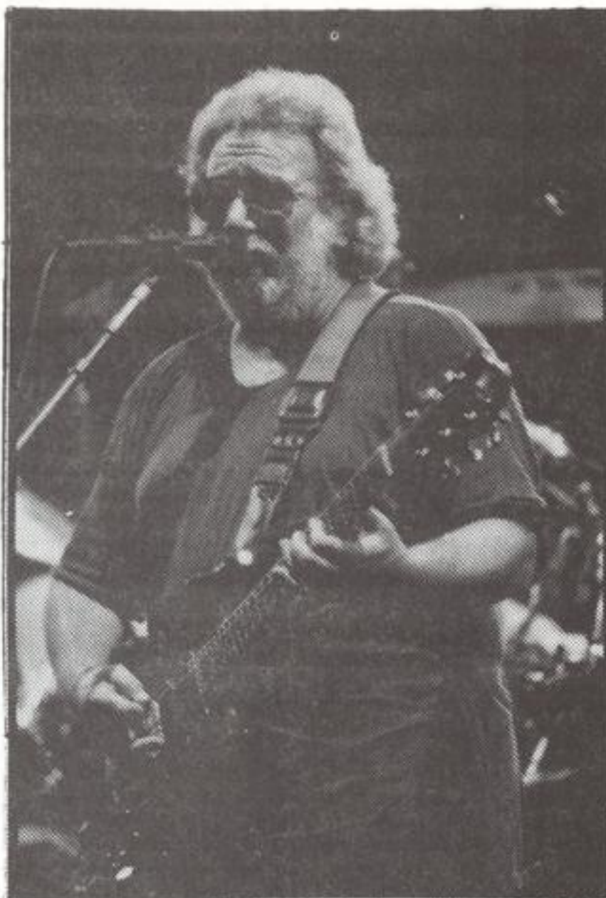
Richfield, OH 9/90