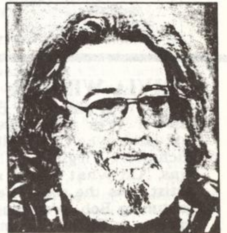
Jerry Garcia's band attracted a colorful throng of "Deadheads" to Caesars Tahoe last weekend.

After an aborted 10-minute attempt at comedy by Rick Wright, Garcia and the band rolled into a lazy groove and the whole crowd began dancing, turning the multitiered casino showroom into the Fillmore, circa 1967. The sound