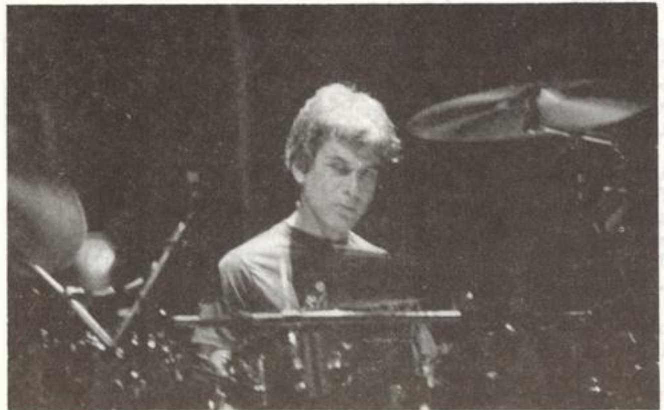
Hampton '86