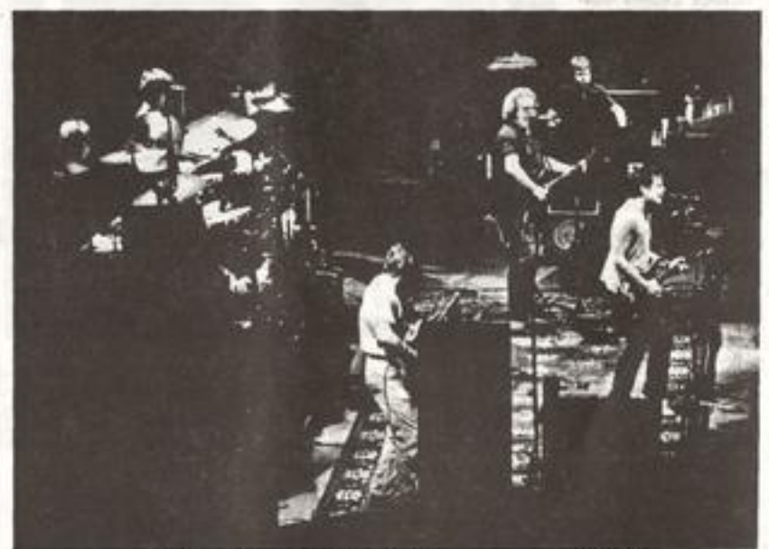
Hampton - 5/25/87