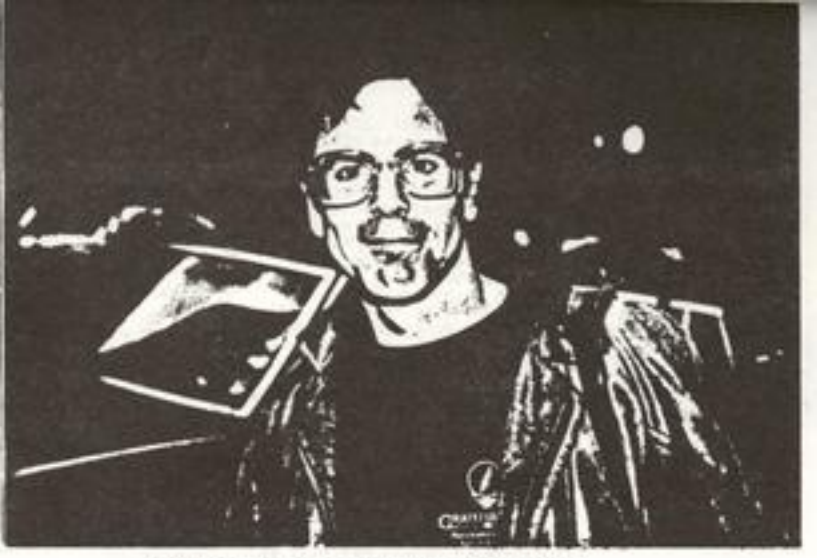
Bob Weir en route to Headlands 4/7/87

CALL HOTLINE FOR COMPLETE TOUR INFO. THIS ARE THE CONFIRMED TOUR DATES AS OF JUNE 11, 1987. CORRECTION: We screwed up in our last issue for printing the Richmond date before it was confirmed. We did have confirmation from Cellaar Door and various other sources that will go unnamed, but we hope we didn't cause to much confusion by printing the error. Sorry folks. LPS NOT LINES: (Wheat) 415-457-6388 (Eeac) 707-777-8655