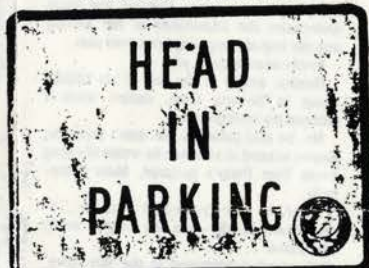
(Dead) heads A striking lot sign near the Coliseum not only informs people about the proper way to park but also has a memento from a recent appearance by a rock group, the Grateful Dead. The skull is a symbol of the Dead Heads, which the group's fans call themselves.

This appeared in the Richmond Times-Dispatch on Thursday, December 6, 1984